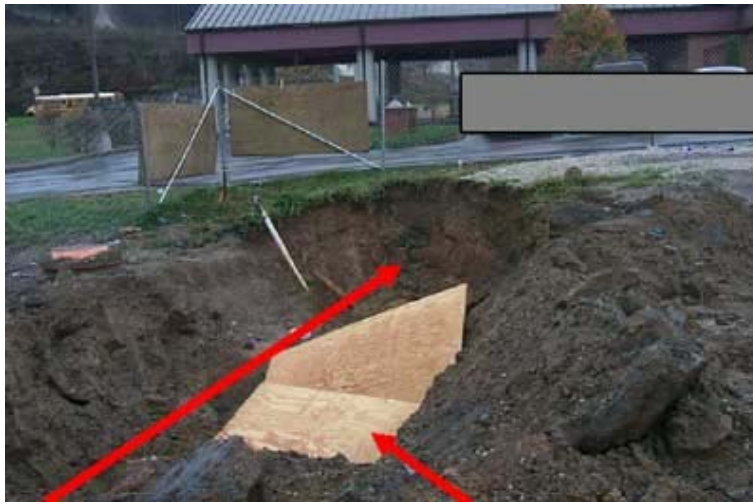
Location of victim in trench when sides collapsed. Plywood used by emergency response personnel.